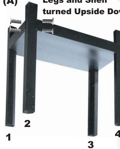
(A) Legs and Shelf turned Upside Down